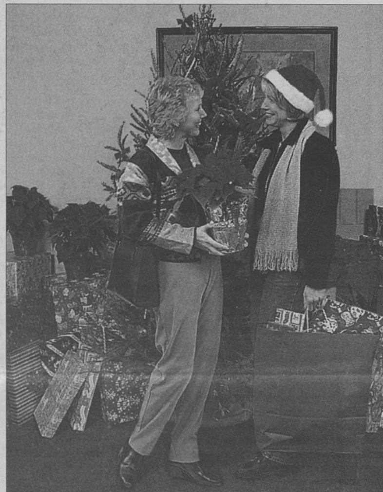
Give the senior in your life a gift that will be put to good use.

Don't underestimate your own sense of creativity when wrapping gifts.